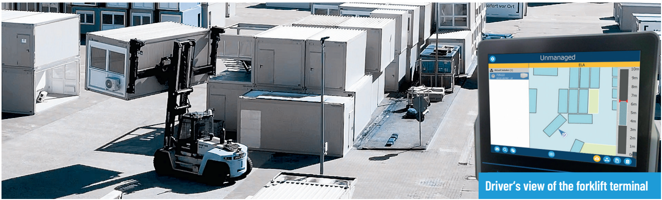
Driver's view of the forklift terminal